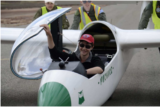
Touchdown after making history.